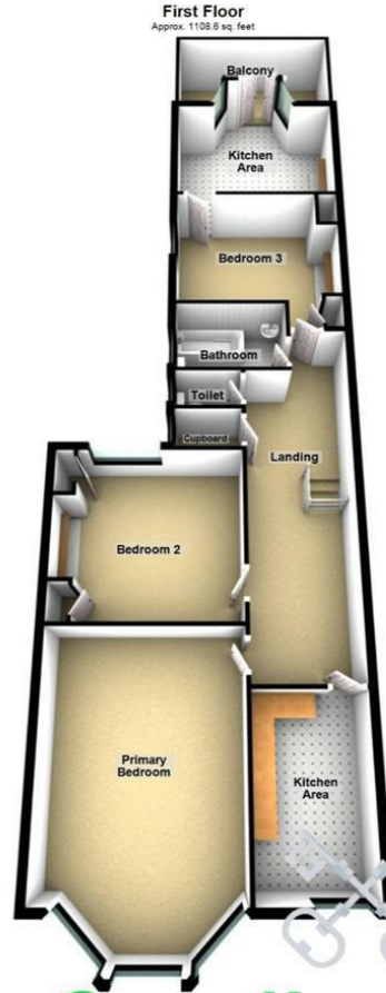
First Floor Approx. 1108.8 sq. feet